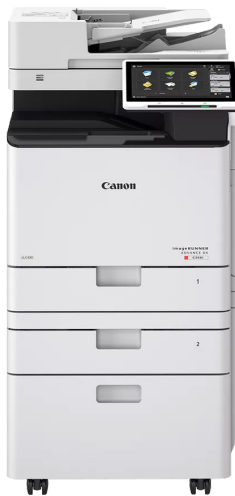
Desktop /Floor Standing

C259i/C359i MFP Compact, A4 MFP Smart, reliable A4 multifunction device supporting secure and efficient document processing